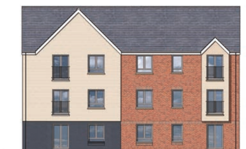
Front Elevation (Ward Street)