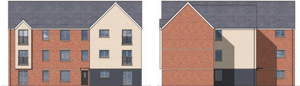
Front Elevation (Hall Park Street)